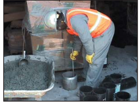
CTS laboratory technician conducting fresh concrete sampling & testing.